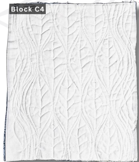
Block C4 Example (9" x 11") using the Dot to Dot Curves & Grid System

For the fill-in of the curves, I do lightly draw them so I have a guide, but it is also random and not meant to be even.