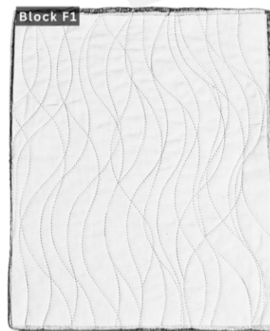
Block F1 Example (9" x 11"): 3" Curves using the Dot to Dot Curves & Grid

This design is also drawn using the 3" curve (or you could use the smaller 2" curve). This uses random drawing to give nice flowing curved lines.