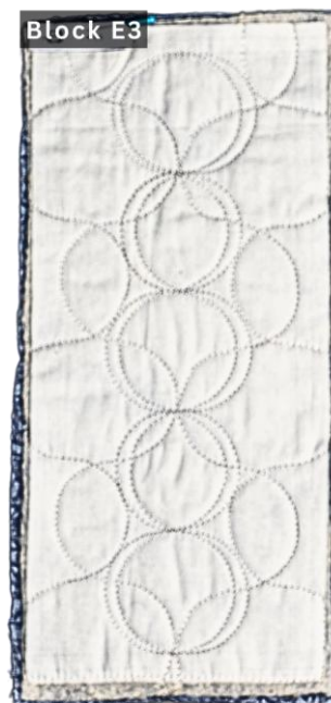
Block E3 Example (5" x 11") using the Dot to Dot Curves & Grid System