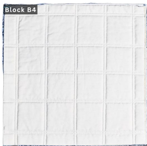
Block B4 Example (11" x 11") using Double Grid Lines

Next, mark a line 2" in from the first line and create lines at 2" intervals. If you would prefer to mark all of the lines, you can then move your ruler across and draw a line 1/4" from the 2" line. Repeat marking 2" and 1/4" lines.