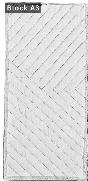
Block A3 Example (5" x 11") using \frac{1}{2} " Straight Lines