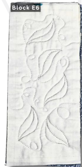
Block E6 Example (5" x 11") using the small leaf template from Set F

Always draw in one direction, either towards or away from yourself; never go forwards and backwards with your pencil.