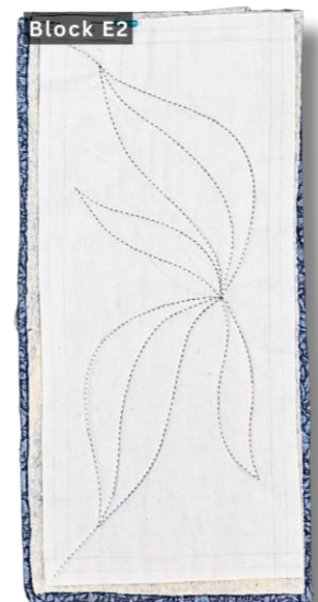
Block E2 Example (5" x 11") using the large leaf template from Set F

Draw as many larger leaves as you would like to on your block. You might like to flip your template over or use just part of the leaf to create more designs.